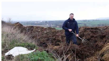
▶ How to sample farmyard manure

Do not attempt to sample direct from the lagoon unless there is a secure operator's platform that provides safe access. If the slurry has been well agitated, subsamples can be obtained from the slurry tanker or irrigator. If the tanker is fitted with a suitable valve, it may be possible to take five subsamples from this stationary tanker at intervals during filling or while field spreading is in progress.