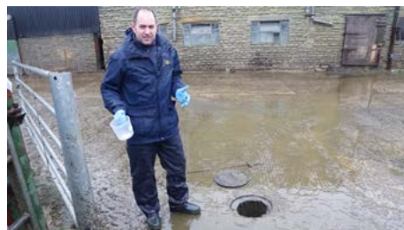
▶ How to sample slurry

Videos on how to sample farmyard manure and slurry are available at ahdb.org.uk/rb209